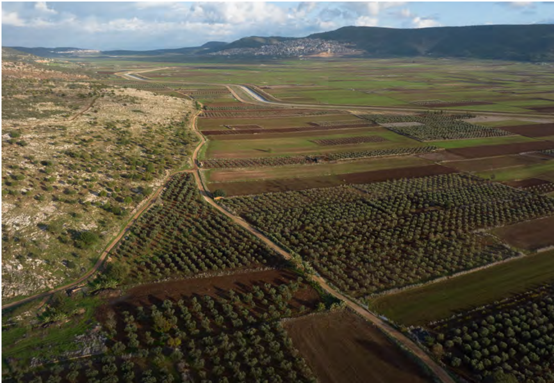
VIEW EAST: THIS PHOTO WAS TAKEN FROM ABOVE CANA LOOKING TOWARD THE EASTERN END OF THE BEIT NETOFA VALLEY. THE ROAD RUNS AS IT DID ANCIENTLY FROM CANA TO THE SEA OF GALILEE AND CAPERNAUM. ALSO VISIBLE IS ISRAEL'S NATIONAL WATER CARRIER (TOP CENTER) RUNNING THROUGH THE VALLEY TOWARD THE COAST.

So the father knew that it was at the same hour, in the which Jesus said unto him, Thy son liveth: and himself believed, and his whole house. (John 4:46–54, emphasis added) 13