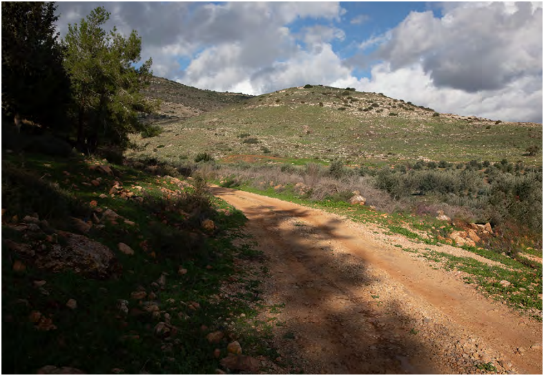
VIEW NORTHEAST: THE ROAD TO CANA (TOP CENTER), COMING FROM THE COASTAL CITY OF ACCO/PTOLEMAIS IN THE WEST (SEE MAP BELOW).